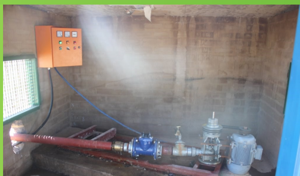
Borehole Engine Room