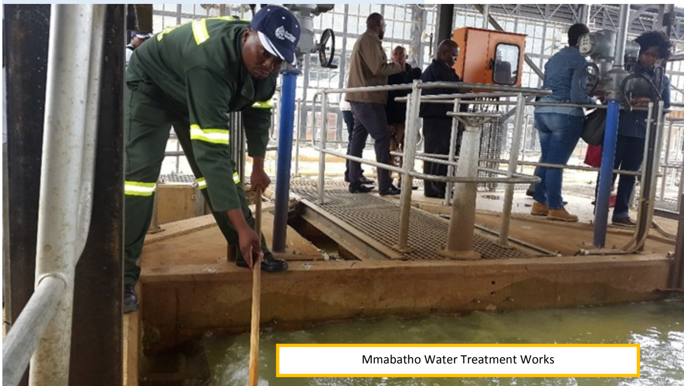
Mmabatho Water Treatment Works

Capacity will be increased from 20L to 30L per day. Mahikeng Water Treatment Works is situated 5 kilometres to the East of Mahikeng town and has a total allocation of 30 mega litres per day, which constitutes 20ML per day from Grootfontein and 10ML per day from Molopo Eye. The Plant has a design treatment capacity of 45 mega litres per day (16.4 million m 3 /a). The raw water quality from these two abstraction points are satisfactory, as only disinfection is applied.