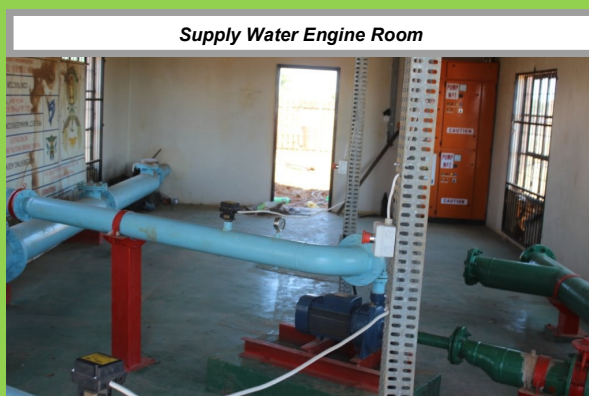
Supply Water Engine Room