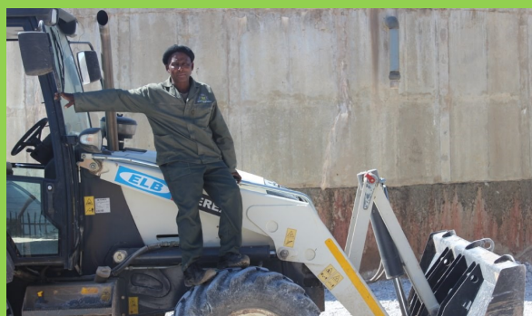
Bodibe Water Storage Tank Yard, Maintenance TLB