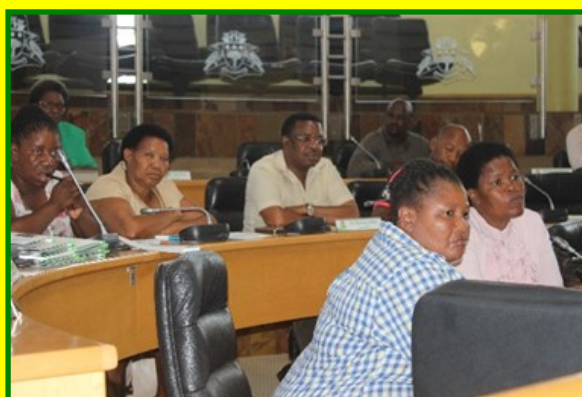
Ngaka Modiri Molema District Municipality Councillors