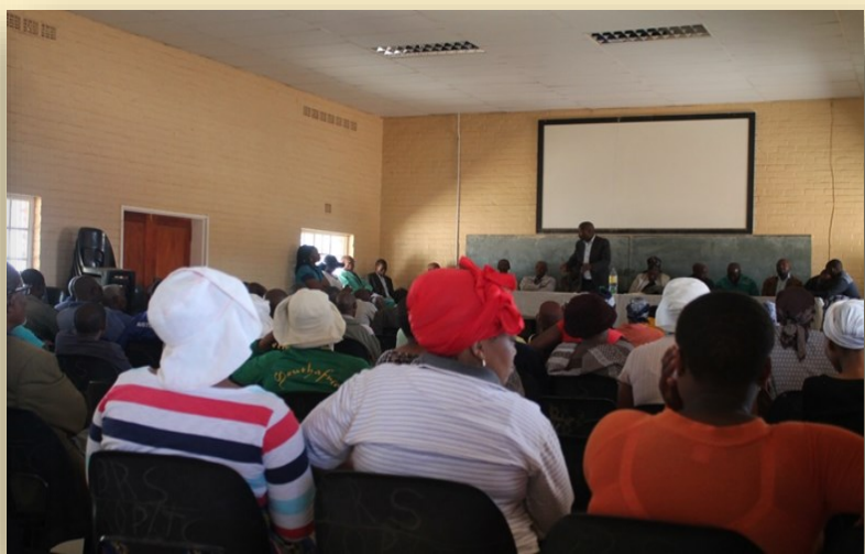
Members of the community listen attentively during drought mitigation campaign