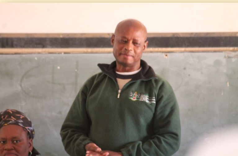
A representative from READ outlining the importance of conserving water

Department of Rural, Environment and Agricultural Development (READ) representative made a commitment to community members in assisting them with feeds for their livestock. The Kopela tribal authority office and community members were grateful of this initiative and pledged to take part in saving water and conquer drought.